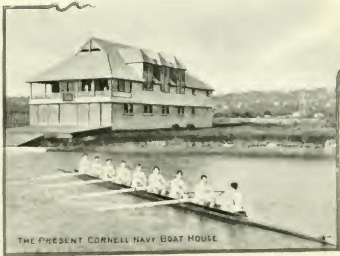
THE PRESENT CORNELL NAVY BOAT HOUSE